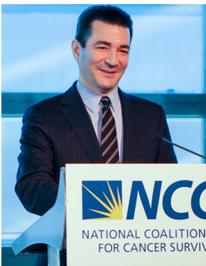
SCOTT GOTTLIEB, MD COMMISSIONER FOOD AND DRUG ADMINISTRATION